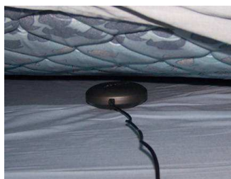
A bed shaker