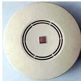
A smoke alarm